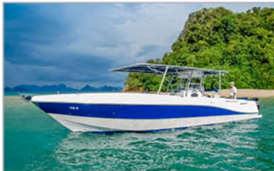
SILVERCRAFT 36 CC (Open)