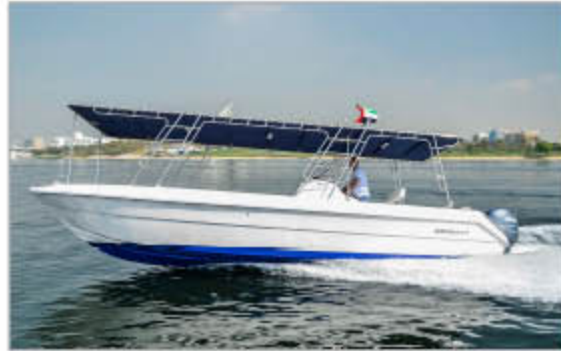
SILVERCRAFT 31 CC