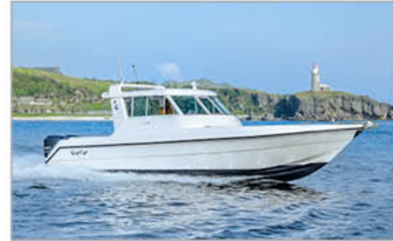
SILVERCRAFT 31 HT