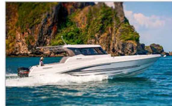
SILVERCRAFT 36 HT