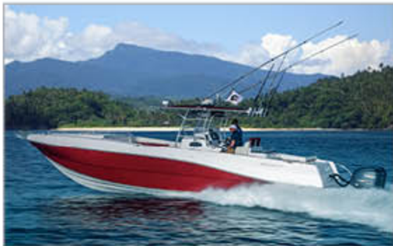
SILVERCRAFT 36 CC (Cuddy Cabin)